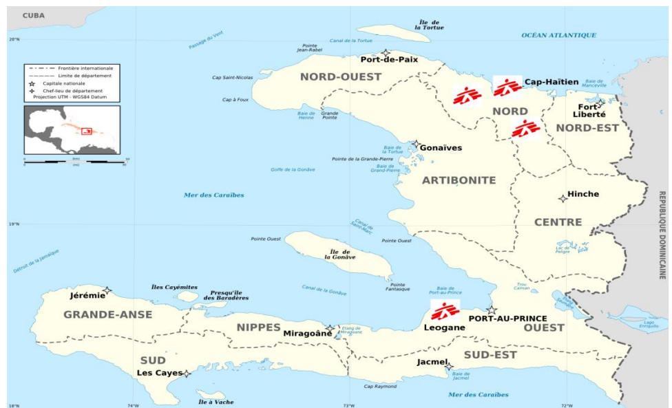
Figure 1: Map of departments in Haiti and OCG interventions

Geographically, three zones with different characteristics are distinguished: a coastal area with high level of flood waters, a mountainous area prone to erosion with many natural resources and drier lowland areas. Haiti is located on the western part of the island of Hispaniola, shared with the Dominican Republic. Haiti covers a total area of approx. 27 700 km 2 . The estimated population was about 10 million in 2009, with 42% under 14 years old. Source: Haitian Institute of Statistics and Informatics, total population, population aged 18 and over households and densities estimated in 2009, March 2009